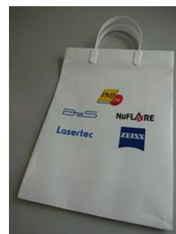
PMJ2018 Congress bag

Fee: ¥100,000 for exhibitors, ¥200,000 for non-exhibitors