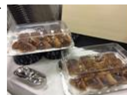
Morning coffee image