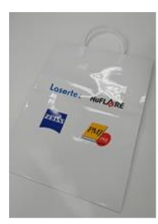
Congress bag of PMJ2017

If the applications are not submitted by January 16 (Tue.), we will start to accept the application from the companies other than exhibitors after January 17 (Wed.).